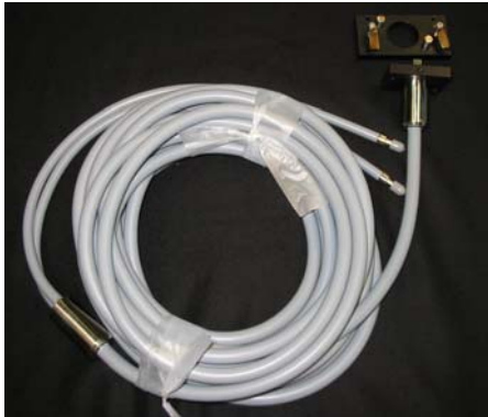
LIGHT GUIDE, PART1, PART2

After mounting this two parts, it is possible to dismount the light guide (including the Holder Part 2) from the Slit. The calibration of the system will stay within about 1 %.