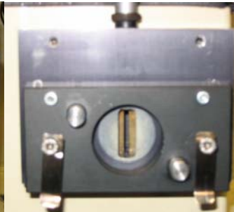
HOLDER PART 1